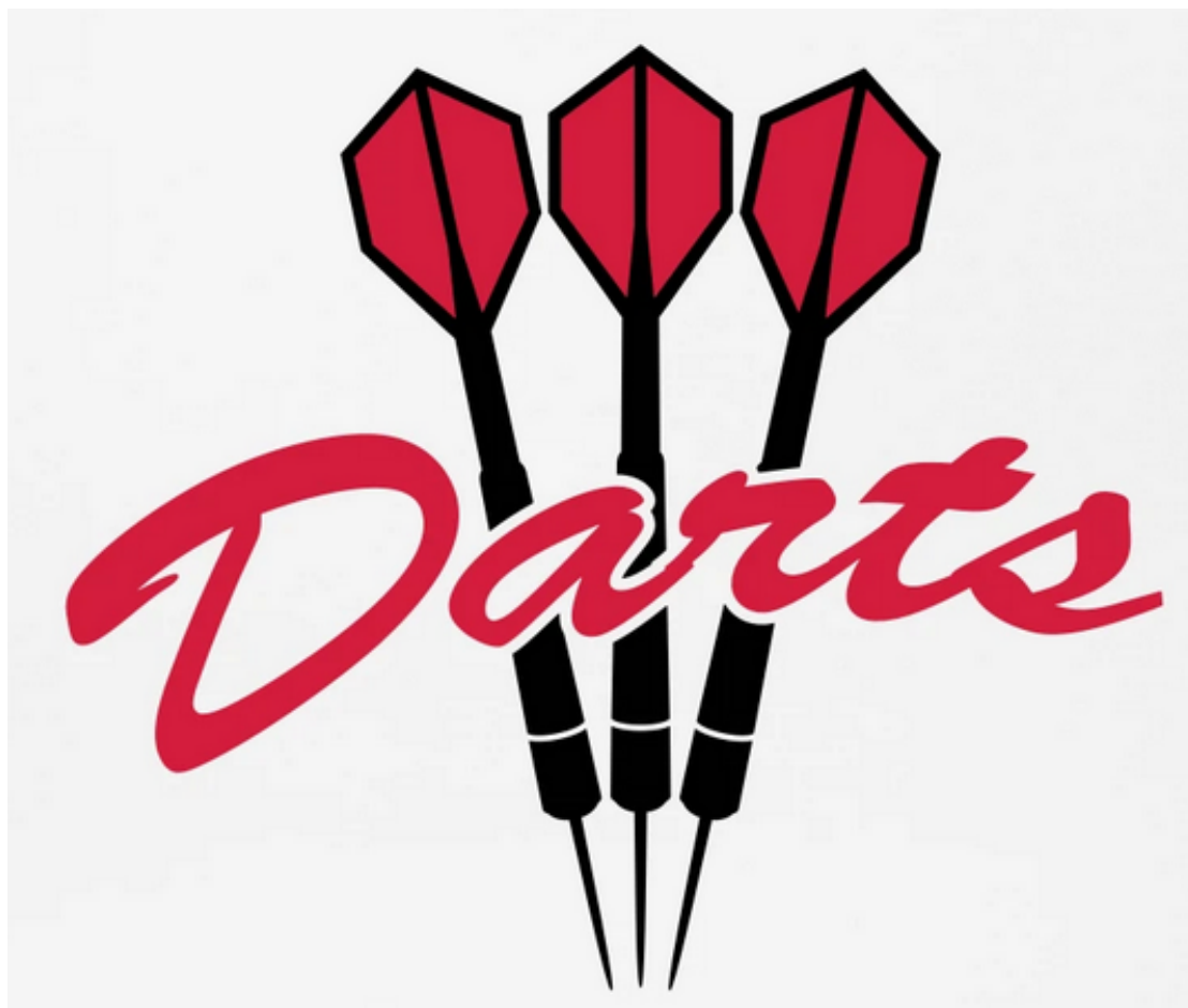
Figure 1: DARTS

Monday 19 September 2022 16:40 (20 minutes)