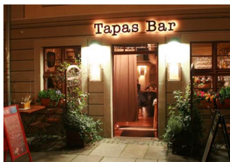
An der Dreikönigskirche 7, 01097 Dresden