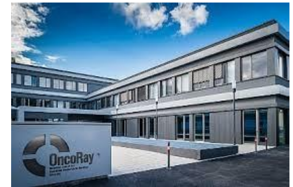
OncoRay Dresden, Händelallee 26, 01309 Dresden