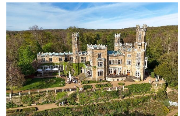
Schloss Eckberg, Bautzner Str. 134, 01099 Dresden

The RAPTOR has received funding from the European Union's Horizon 2020 Marie Skłodowska-Curie Actions under Grant Agreement No. 955956